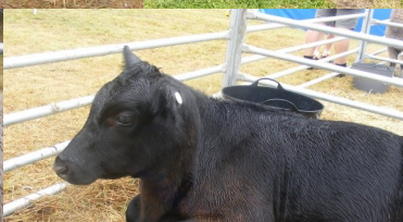
Razzle & Dazzle