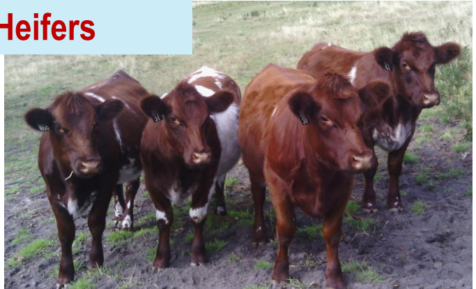
Ellie Ramona Stephany Ornamental