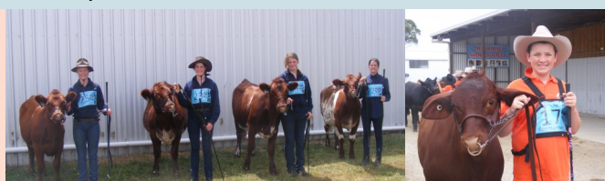
Tasman Junior Cattle Handlers