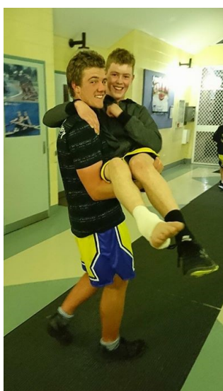
Hammerhead (Huon) carrying out injured Tigershark (Pat).