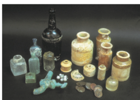
Artefacts recovered from the Brahmin

NOTE: Our program is very popular and places are limited, so please call or email us to make a booking very soon . We ask that a guardian accompany young children.