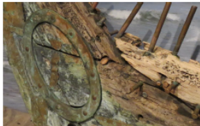
Part of a shipwreck recovered from Hope Beach

(for this fee you gain entry to the whole Museum on the day)