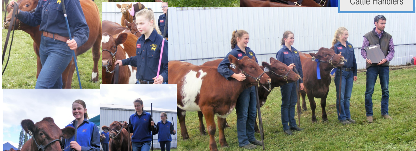
School Team of Three—Chris Best Trophy Winners