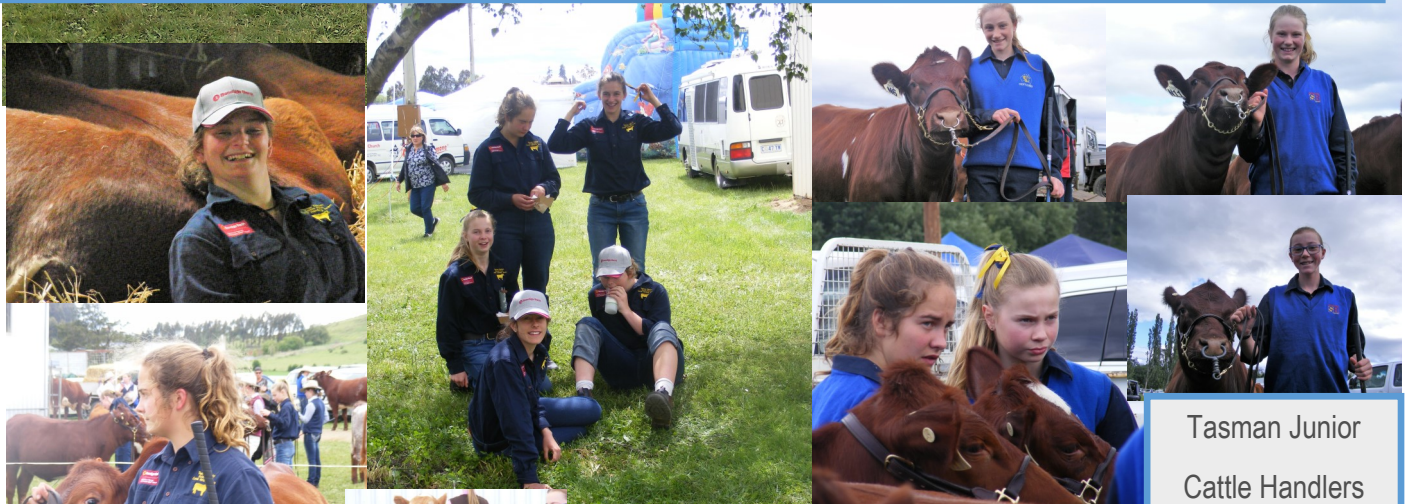
Tasman Junior Cattle Handlers