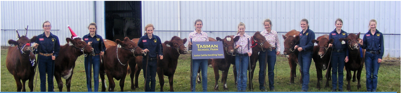
Tasman School Teams of Three Cattle Handlers