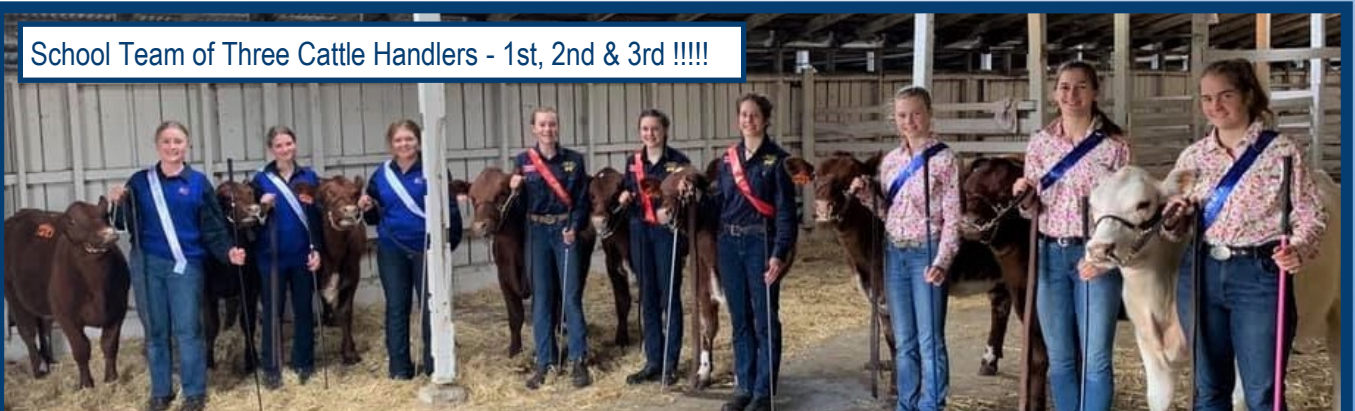
School Team of Three Cattle Handlers - 1st, 2nd & 3rd !!!!!

Food & Fibre Production at Tasman District School