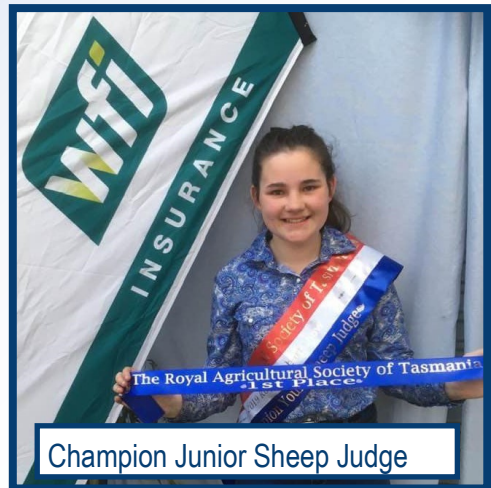
Champion Junior Sheep Judge