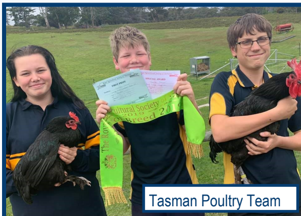
Tasman Poultry Team