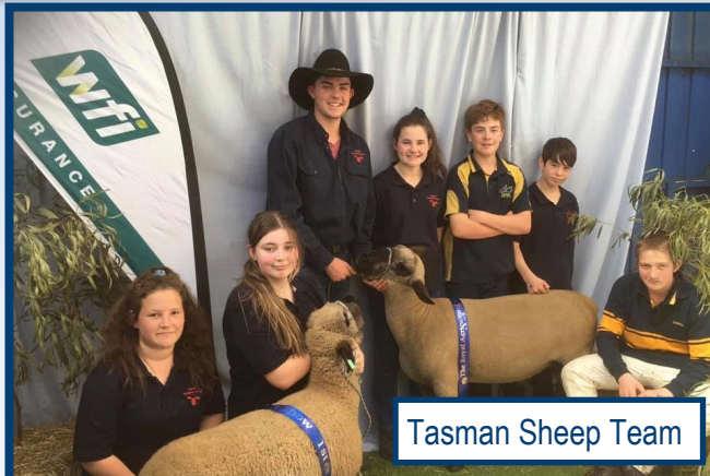
Tasman Sheep Team